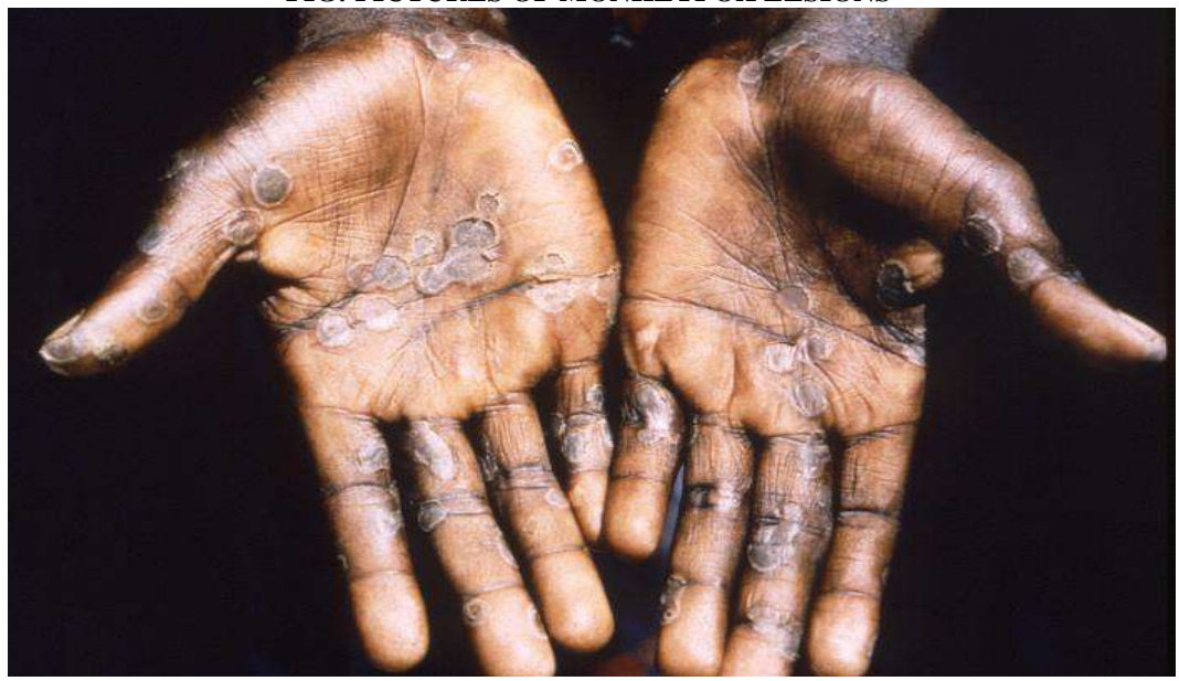
Monkeypox lesions on palms. Public Health Image Library 3