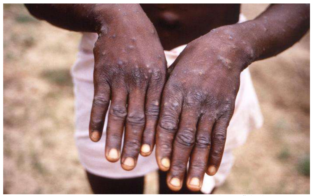
Monkeypox lesions on hands. Public Health Image Library #12763

Volume 7, Issue 4 July-Aug 2022, pp: 1644-1673 www.ijprajournal.com ISSN: 2456-4494